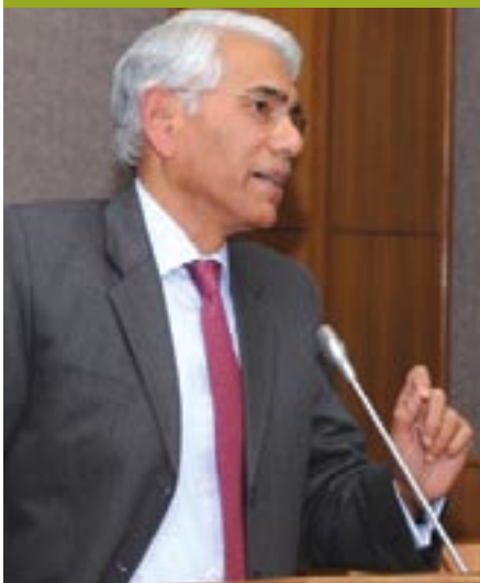
Mr. Vinod Rai, C&AG of India addressing participants

The Comptroller and Auditor General (C&AG) of India is an independent constitutional authority appointed by the President of India to head the Supreme Audit Institution (SAI) of India. As one of the pillars of the world's largest democracy, the C&AG of India is mandated to promote excellence in public sector Audit and Accounting Services for improving the quality of the country's governance.